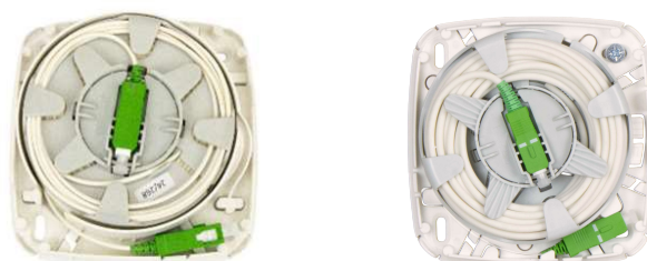
SC/APC optical extension reel Ø1.6 mm Optical Extension Box SC/APC Ø 0.9 mm